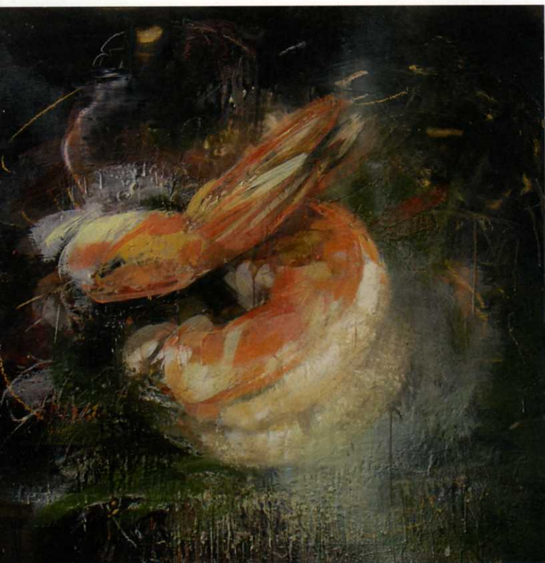
Savannah: Better Days , 2006, encaustic and cornmeal on canvas, 48 x 48"